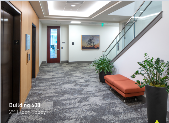
Building 608 2 nd Floor Lobby

Welcome to Columbia Tech Center. We're excited you're here.